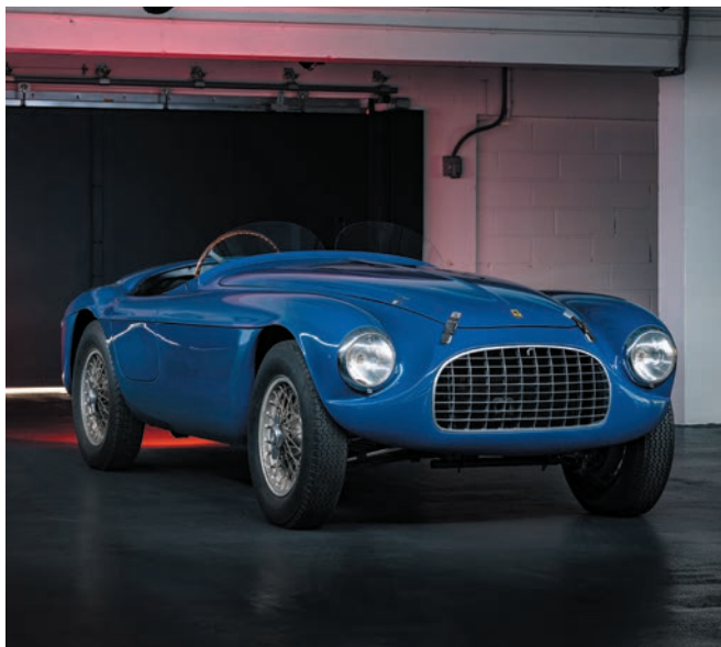
1951 Ferrari 340 America Barchetta Touring Superleggera Vendue 5 706 000 €, Rétromobile 2023