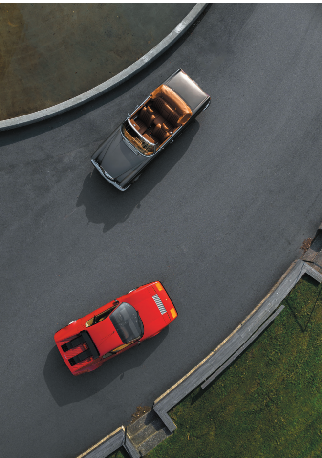
Lot 34 Mercedes-Benz 280 SE Cabriolet Lot 39 Ferrari 512 BB